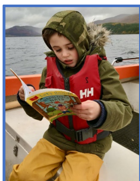
In a boat on a loch