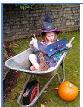
In a wheel barrow